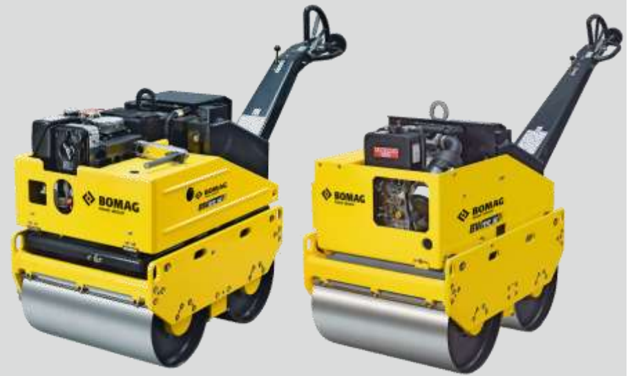
BW 65 H