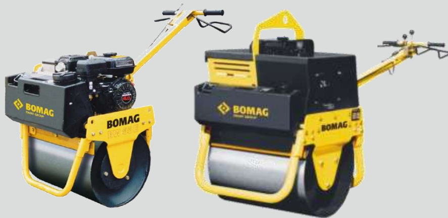
BW 55 E