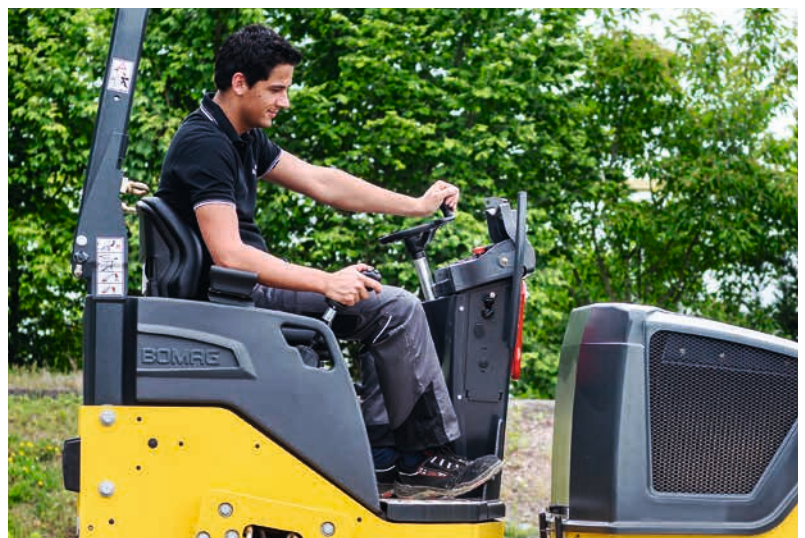
Ample leg room for the operator ensures a comfortable working environment.

The response of the control lever is very pleasant; reversing is modulated and very precise. Drum vibration can be activated selectively for the front or rear only, or for both drums. In tandem with the IVC (Intelligent Vibration Control) system, the exciter system guarantees consistent compaction and reliable operation at all times.