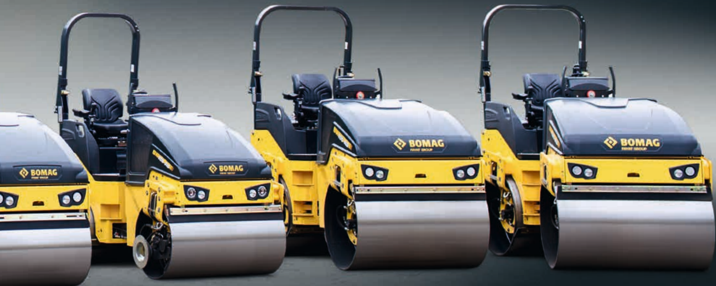
BW 100 AD-5