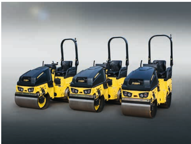
BW 80/90/100: The light line up to 1.8 t.