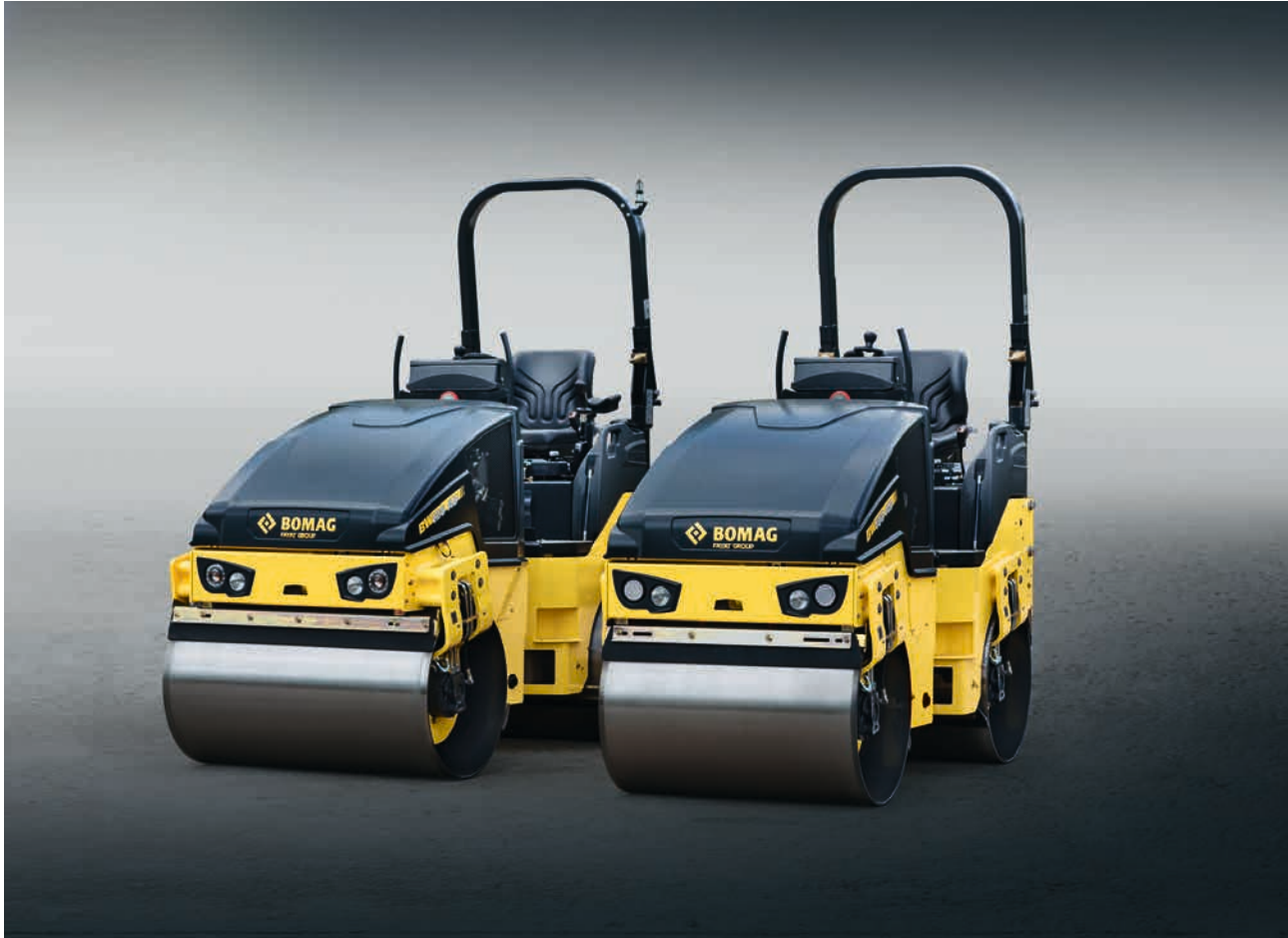
BW 100/120: The multi-talents from 2.3 to 3.7 t.

BOMAG offers the right machine for every application. Select the roller and equipment that is perfectly suited to you, your requirements and your company from 14 different models.