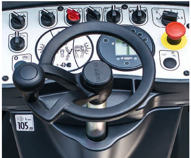
Large switches, a compact steering wheel and clearly arranged controls make it easy for any operator to work with a light BOMAG tandem roller.

Every function is self-explanatory and intuitive to operate after a very short time. As with every BOMAG tandem roller, the main functions can be selected precisely and error-free by the ergonomic control lever.