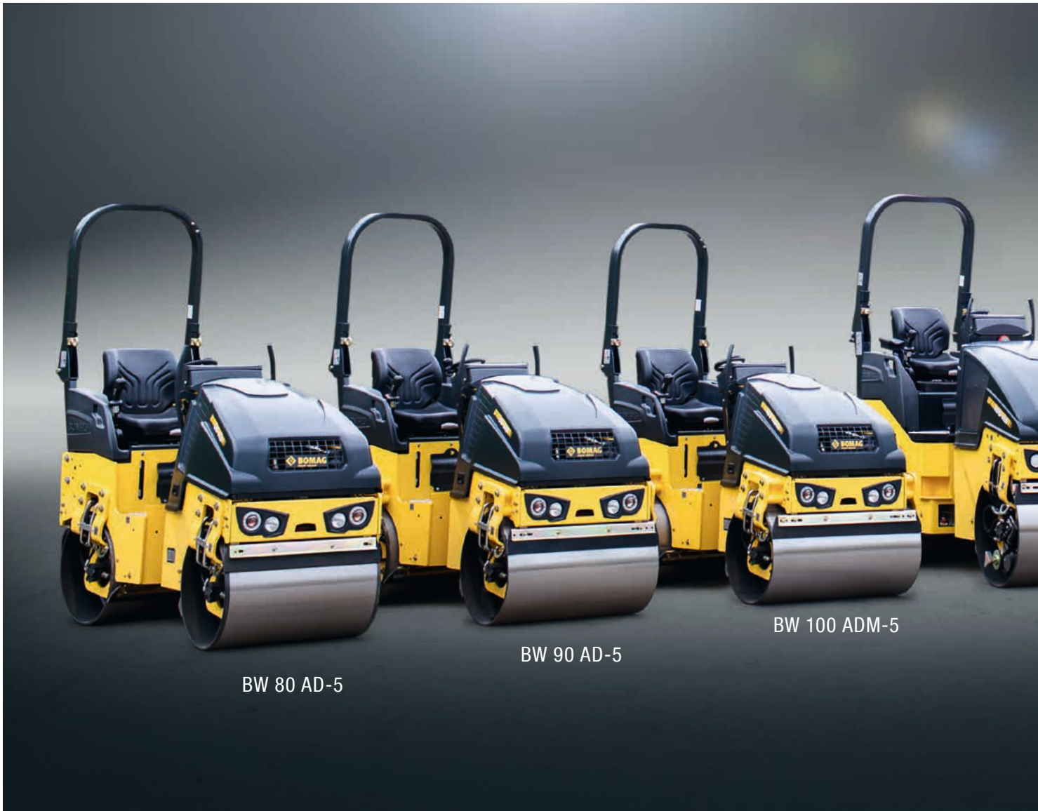
BW 80 AD-5