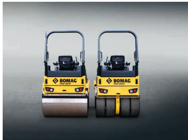
BW 135/138: The heavyweights from 3.9 to 4.3 t.